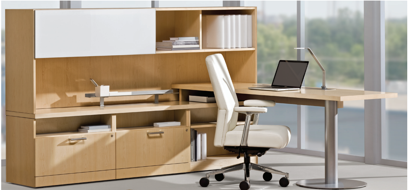
3522 Clear Maple in application.

3222 Quarter Cut Open Pore / 3224 Quarter Cut Full Fill