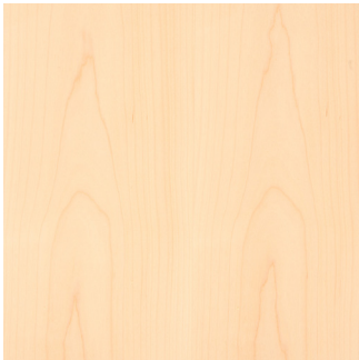
Clear Maple 3522 Flat Cut

If signing on behalf of the customer and/or designer, you are acknowledging the design intent and have educated the customer on the variations and material aging that will occur with a clear coat finish.